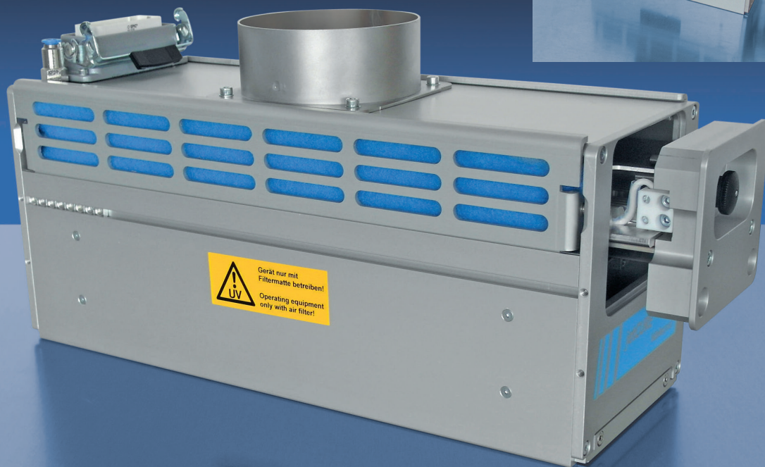
Inkjet UV High-Performance Dryers